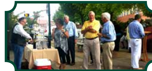
"Join us for fun, networking and more at Downtown Mixers!"

Your support is critical to the effort. The opportunity for community involvement as volunteers, financial supporters, and advocates will result in the comprehensive revitalization envisioned for Downtown South Boston.