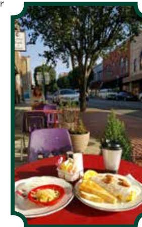
Enjoying breakfast downtown during Restaurant Week in September!