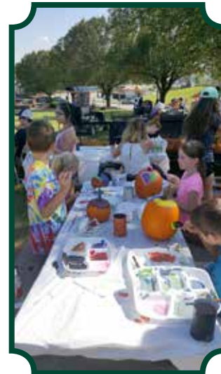
Pumpkin Painting fun at the South Boston Harvest Festival!

Partnering with the Halifax County Department of Tourism, the 1st SoBo Brew Fest was held in May. Partnering with the Town of South Boston and the County of Halifax, a 4th of July Parade, Celebration and Fireworks was held on the 4th of July. Partnering with several area car clubs, a successful Downtown South Boston Cruz-In was held in October. Downtown SoBo Trail of Treats was held on Saturday, October 27.