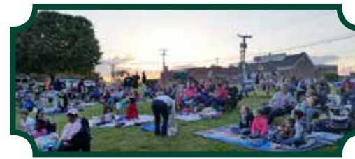
"Enjoyin' a night in Downtown at Movies on Main in Constitution Square!"