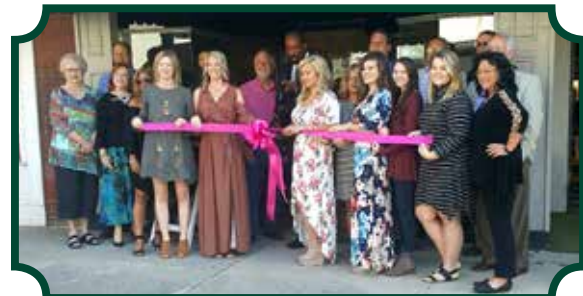
We love opening great new businesses in Downtown South Boston!

Assisted the South Boston Farmers Market .