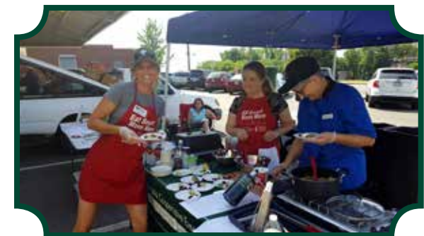
Food Demonstrations at the Downtown South Boston Farmer's Market!